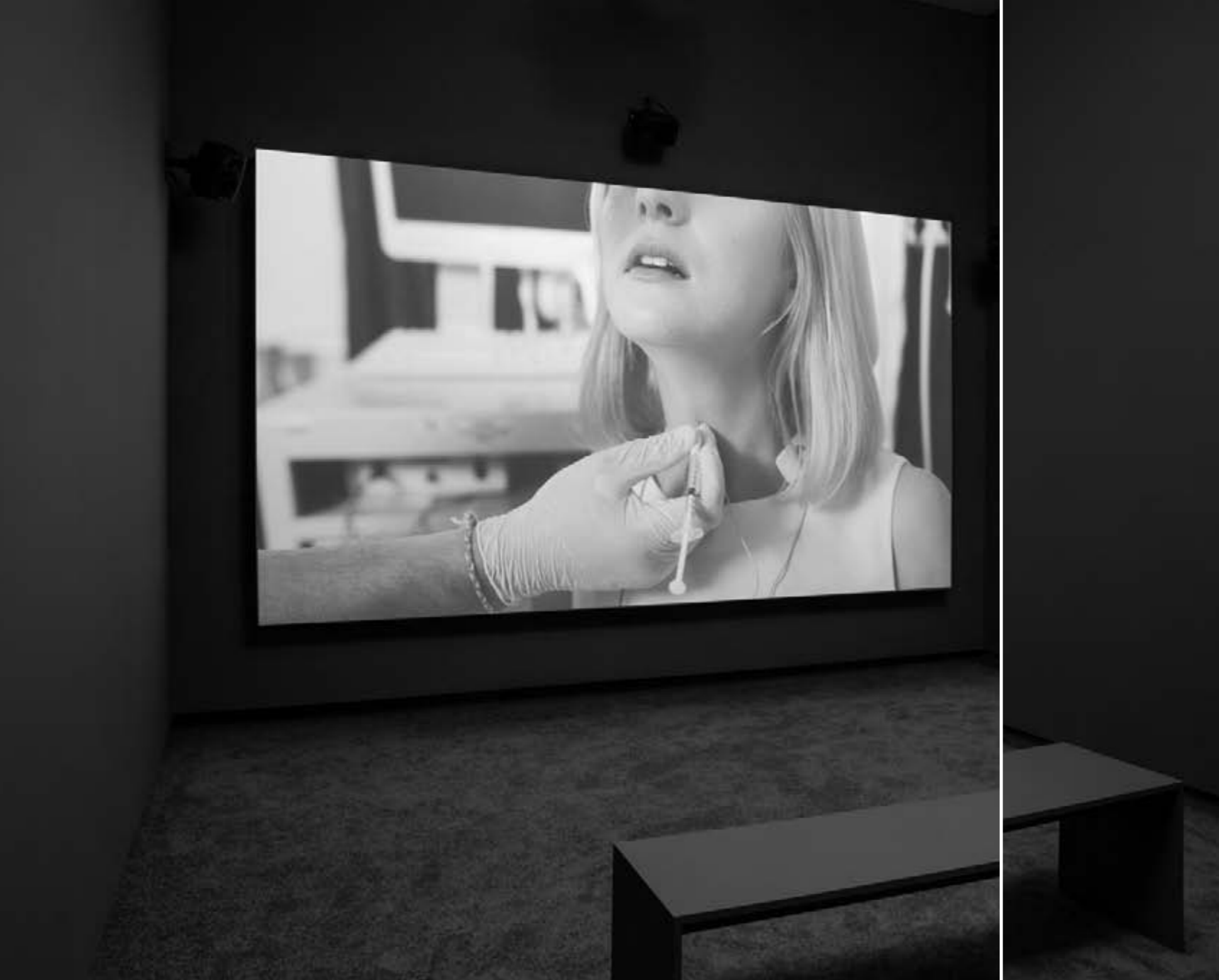
Marianna Simnett, The Needle and the Larynx (2016), installation view.