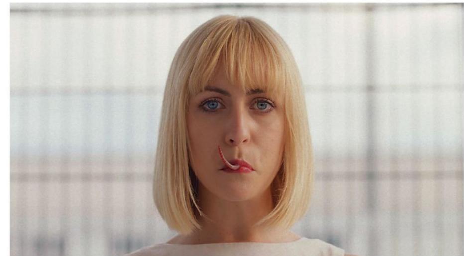
Still from Marianna Simnett's Blood In My Milk , 2018, five-channel HD video, color, sound, 73 minutes.

That sense of unease recurs in Blood In My Milk , most strongly during the scenes of extractions—of a bloodied bone, an imploding vein, a cow's milk. The removal of matter from the body abstracts it, making it simultaneously transfixing and repulsive. It is no longer part of a functioning, internal system, but is isolated as an estranged element that may now be independently modified. The viewer's negative physical reaction to these sights signals self-disgust as well as self-defense, a fear of having these procedures performed on their own body. And that may be why Simnett focuses on chastity as a method of self-preservation. Like fainting, chastity is a refusal to participate, a vow to remain unto oneself. As Isabel's sibling recites, in the third person, "The older brother explains to his sweaty compatriot that no tool [not even a knife] can match the natural power of chastity. I bet you didn't know that."