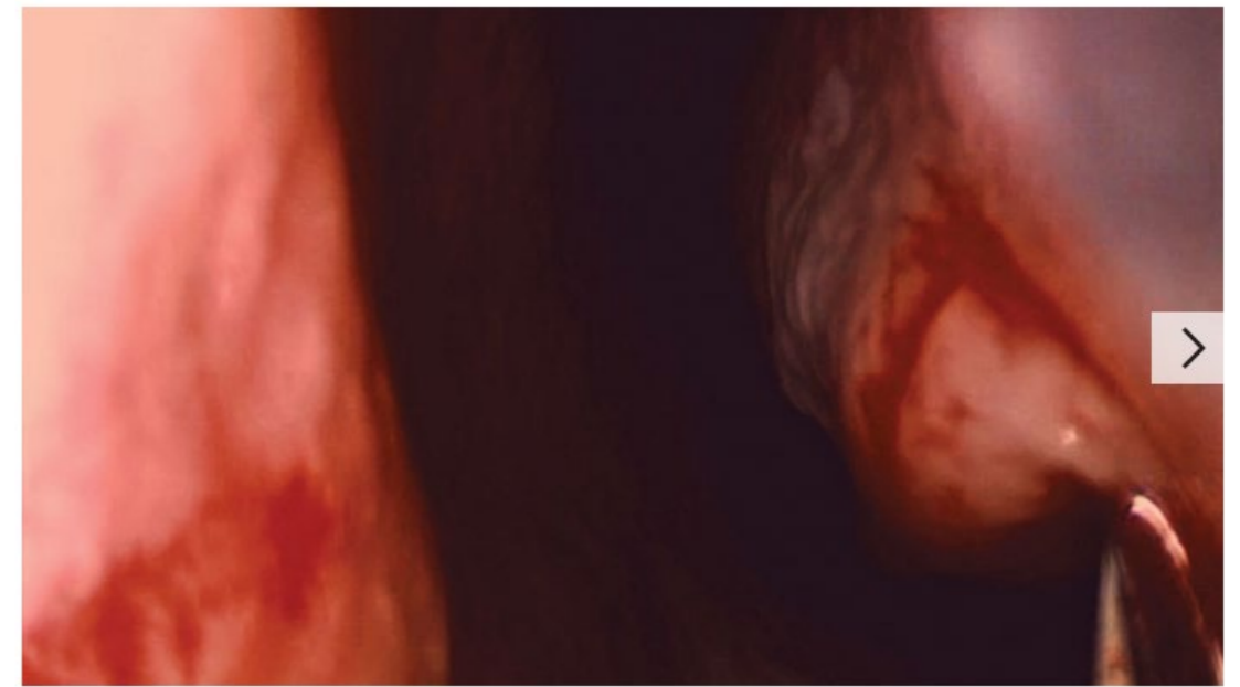
Stills from Marianna Simnett's Blood In My Milk , 2018, five-channel HD video, color, sound, 73 minutes.

cockroach crawling up a naked leg—enhanced via quick cuts through associative footage showing bodies, body doubles, bodily materials, and laboratory experiments.