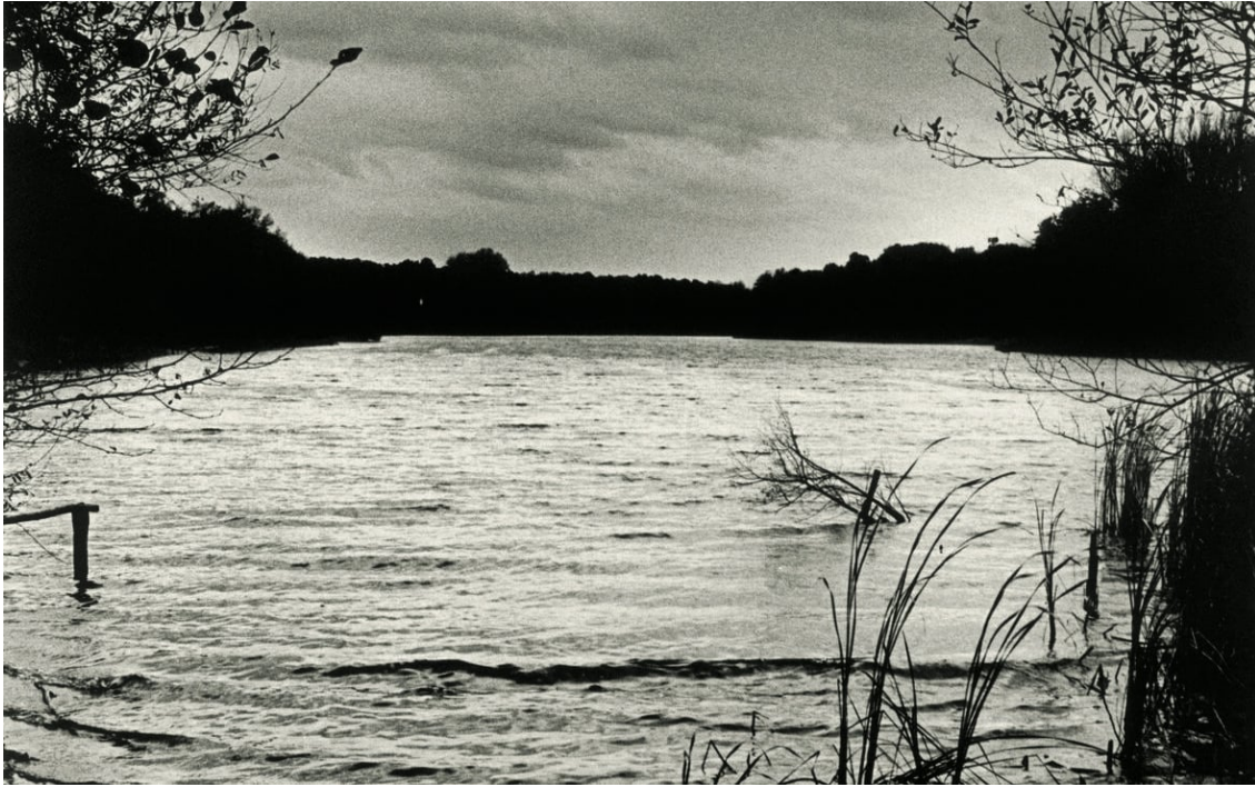
Helmut Newton, Grunewaldsee, Berlin 1996.

Undoubtedly one of the most famous Berliners, large parts of Helmut Newton's archive have been housed in the city's Museum of Photography since 2021. To celebrate the 20th anniversary of the Helmut Newton Foundation, the Museum will host a group exhibition titled "Berlin, Berlin!", an homage to Newton's hometown. The exhibition will feature works by Newton spanning from the 1930s to the 2000s, alongside other images of the places that inspired Newton in the city, as well as interjections from contemporaries.