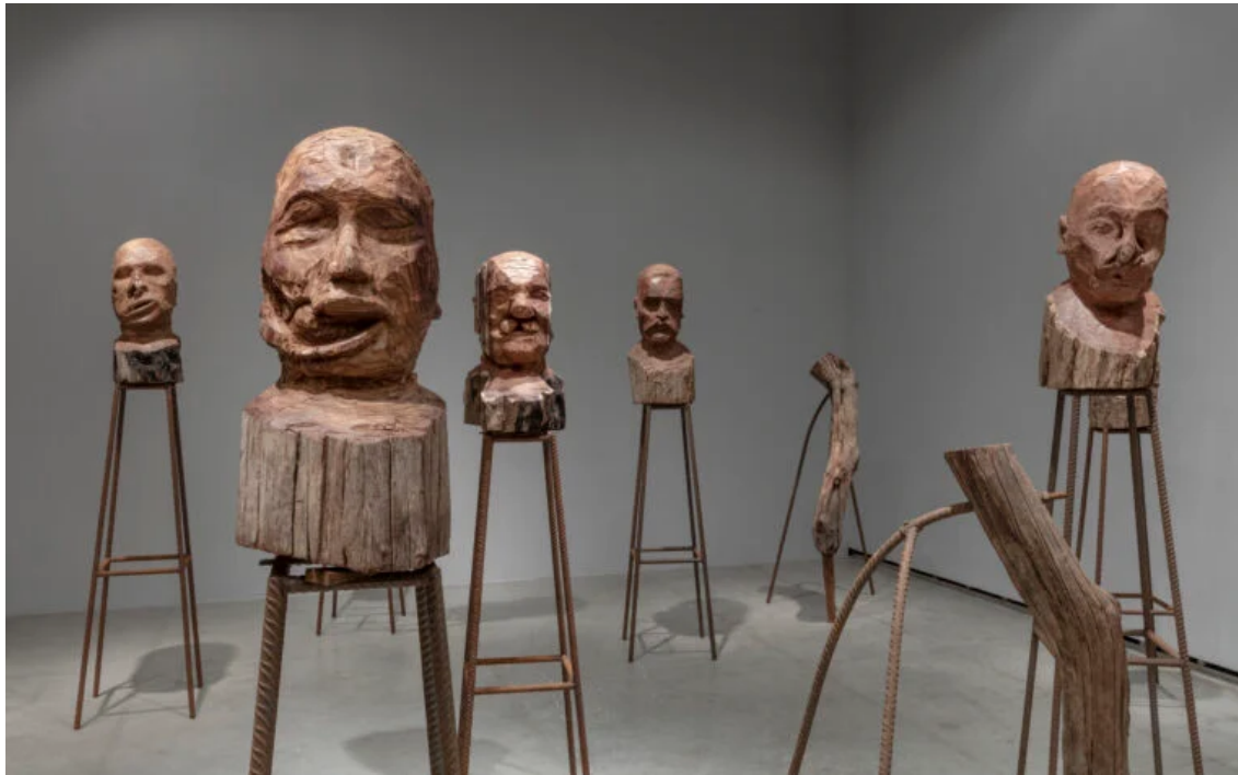
Kader Attia, "J'accuse", 2016, exhibition view Museum für Moderne Kunst, Frankfurt am Main, 2016.

Kader Attia is known for his critical and sensitive work on topics such as postcolonialism, cultural identity, migration and collective memory. His multidisciplinary approach, which includes installations, sculptures, videos and performances, explores fractures and scars in our social, political and cultural landscape. This exhibition at the Berlinische Galerie will showcase two sets of the artist's work, J'accuse and The Object's Interlacing , which explore themes of war, colonialism and repatriation. Works by legendary Dada collageist Hannah Höch will also be on display.