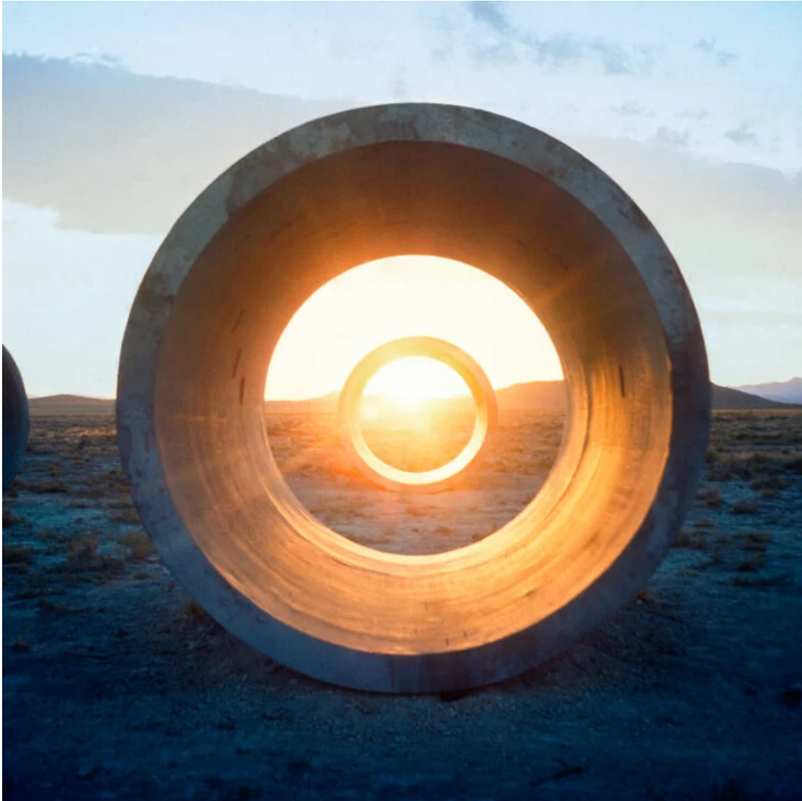
Nancy Holt, "Sun Tunnels" (1973-76), Great Basin Desert, Utah.