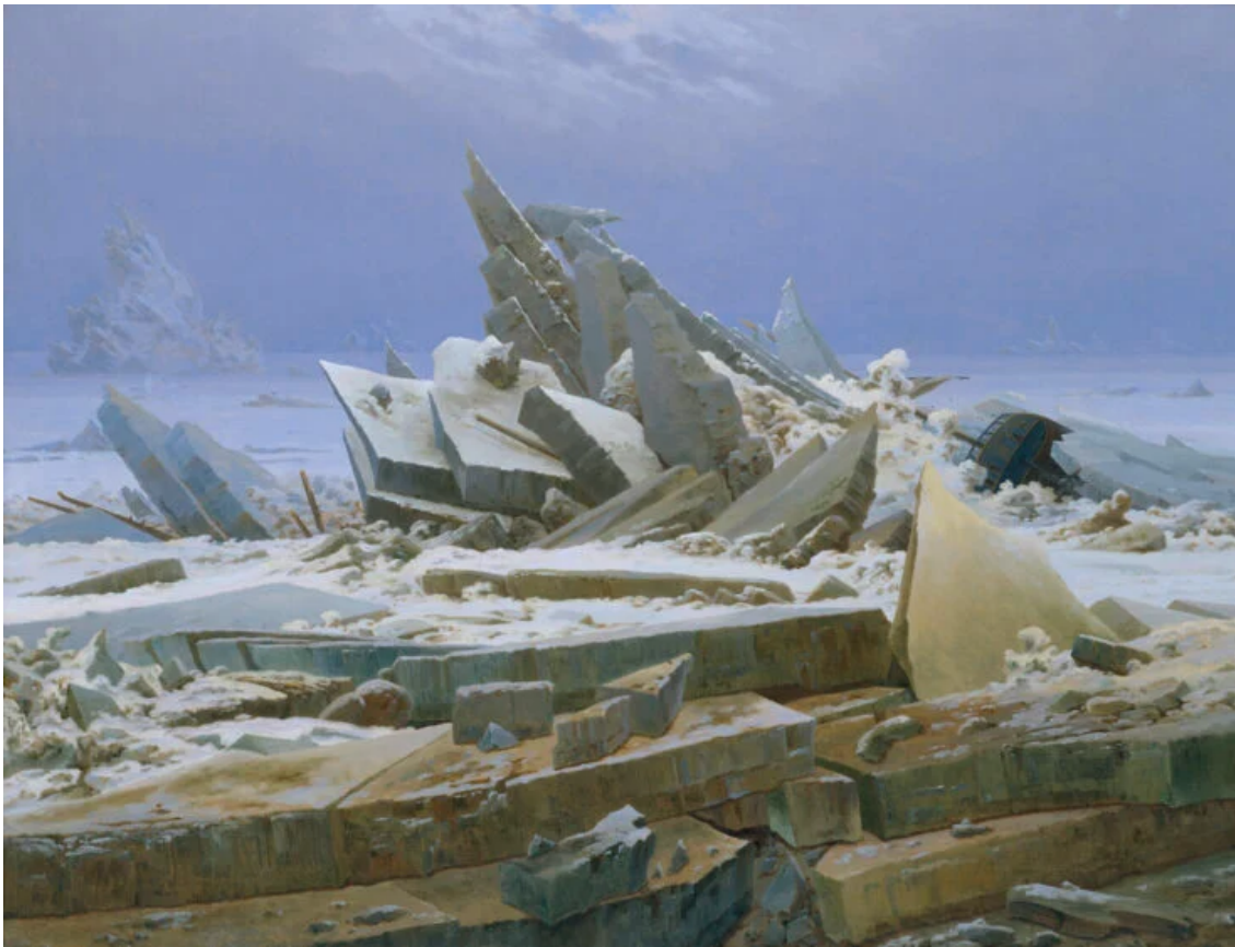
Caspar David Friedrich, "The Sea of Ice", 1823/24

To mark the 250th birthday of the most important painter of German Romanticism, the Alte Nationalgalerie will be joining in the celebrations, which also include a year-round program of events in the artist's birthplace of Greifswald. The collaborative and comprehensive exhibition at Alte Nationalgalerie will feature around 60 paintings and 50 drawings by Caspar David Friedrich, including his famous Arctic Sea , and will highlight the central role the Nationalgalerie played in the rediscovery of the iconic painter at the beginning of the 20th century.