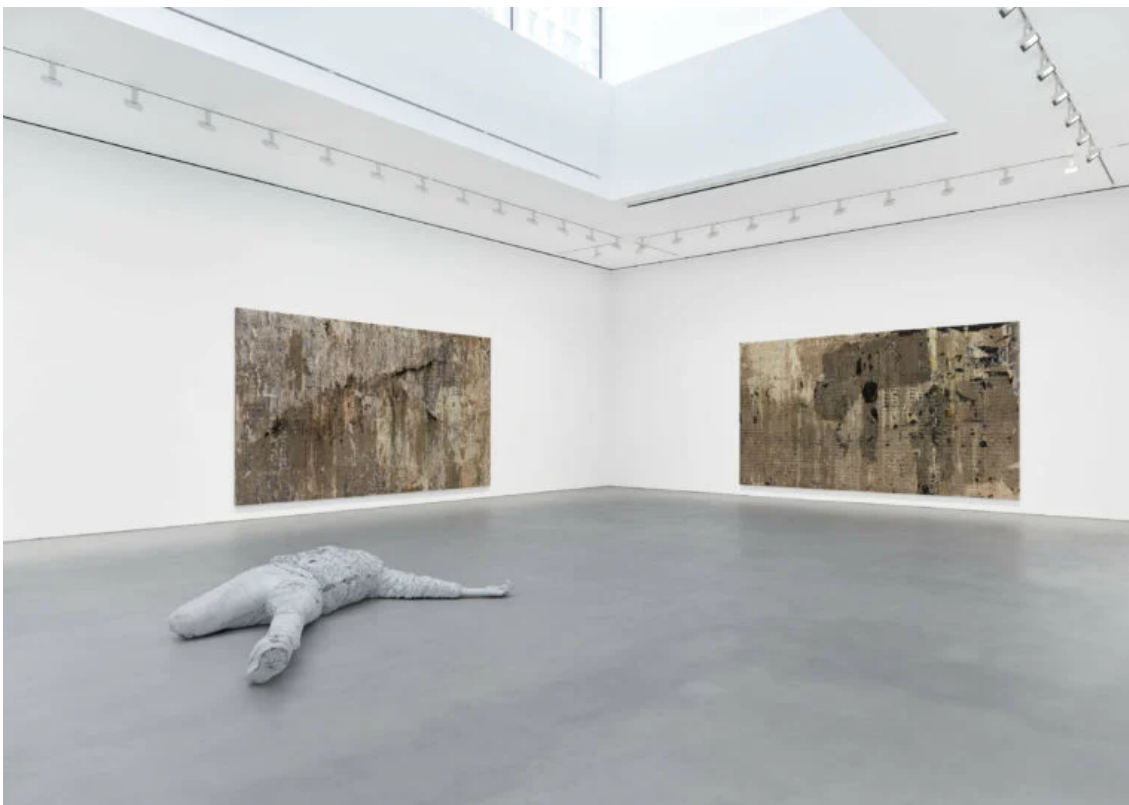
Exhibition view by Mark Bradford "You Don't Have to Tell Me Twice", 2023.