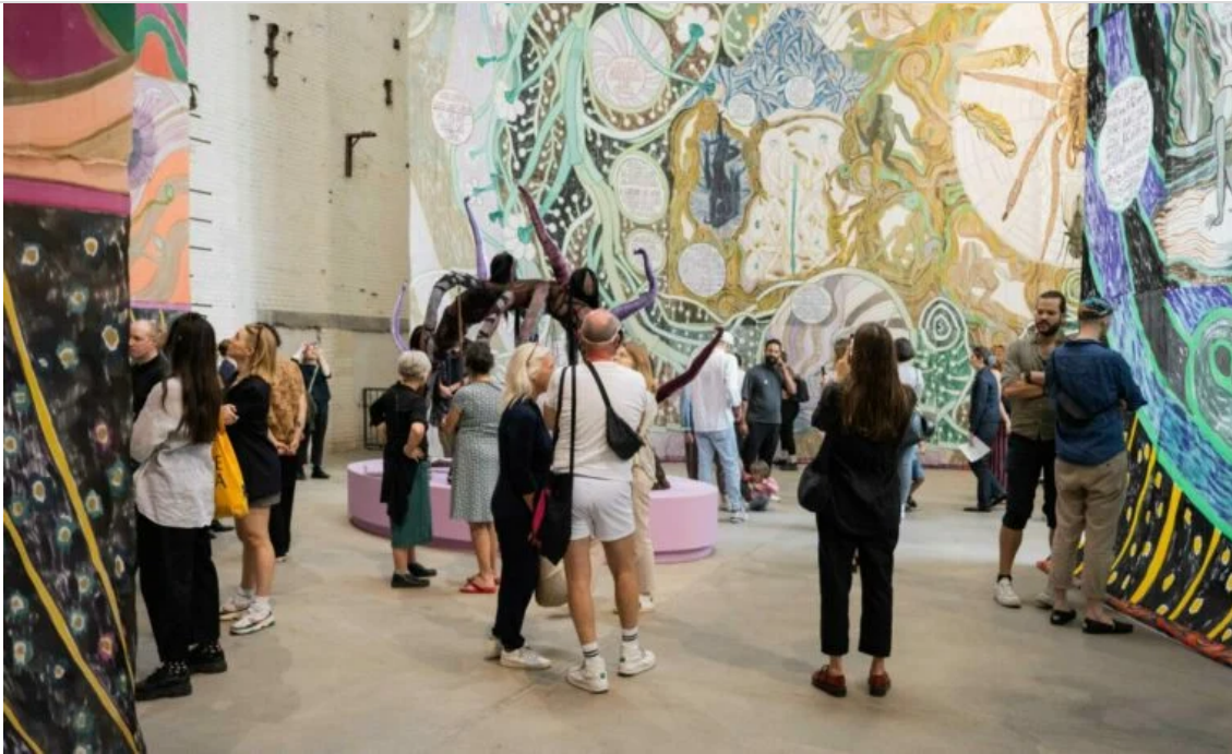
Berlin Art Week 2023 at Kindl in Neukölln.

During these five days, it becomes very apparent just how many artists there are in Berlin. Hundreds of galleries, from newcomers to established institutions, will showcase exciting projects and open their doors to ordinary people and collectors alike. An incredible opportunity to get caught up in the buzz of the art world, attend panel discussions and discover your next art obsession.