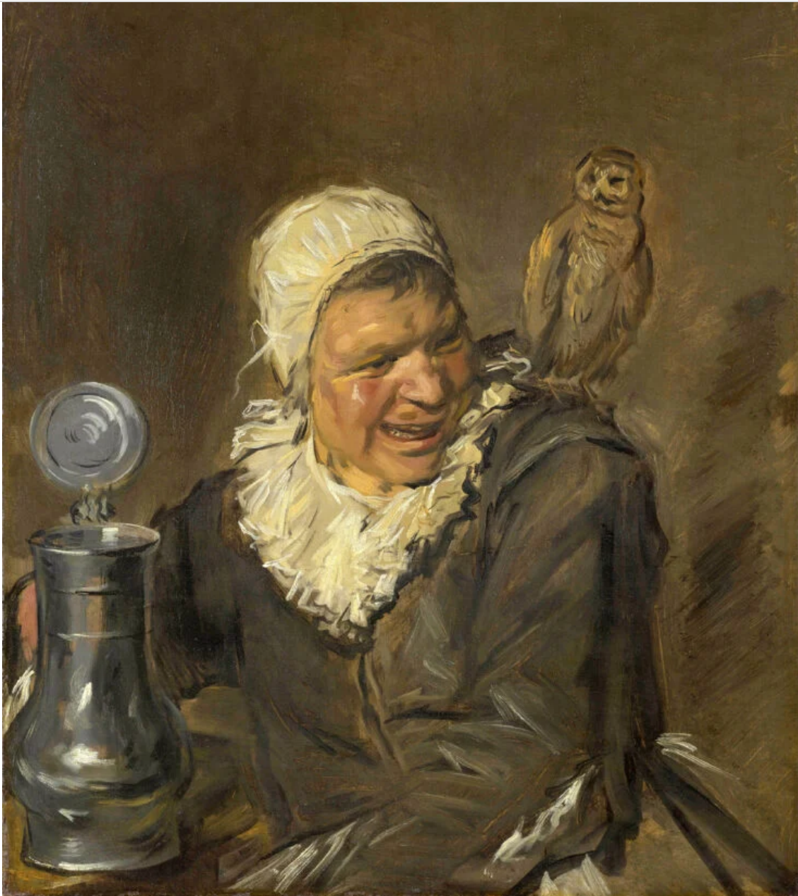
Frans Hals, "Malle Babbe", around 1640, Berlin.

One of the most respected Dutch painters of the 17th century, Frans Hals is remembered alongside the likes of Rembrandt and Vermeer. This comprehensive exhibition, produced in cooperation with the National Gallery in London and the Rijkmuseum in Amsterdam, showcases around 70 works by the artist. Famed for his loose brushwork and lively compositions, Hals is considered a pioneer of modernism and was an inspiration for realists and impressionists such as Max Liebermann and Wilhelm Leibl.