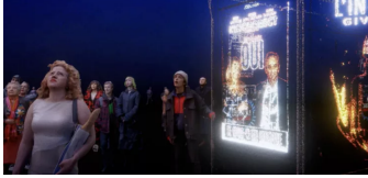
Berlin art: What exhibitions are on now?