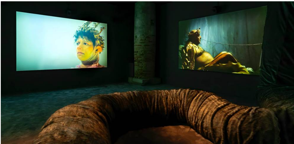
Marianna Simnett, The Severed Tail , 2022, Venedig © Courtesy: the artist, La Biennale di Venezia and Société, Berlin / Photo: Roberto Marossi

'Winner' is a multichannel film installation commissioned for the art and culture programme of the UEFA EURO 2024 tournament. It explores the beautiful game through a three-act ballet, looking at football's socially constructed power hierarchies, crowd psychology, and constant pressure to perform. The film's hallucinatory world extends beyond the screen into the exhibition space and museum garden, as visitors are guided through the installation by barriers, like those you would find in a stadium, and the film itself spreads around the space.